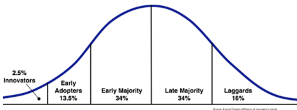
Figure 1: Innovation Adoption Curve 13

Our theory of change builds on this idea and focuses deeply on the bold teams of educators in this combined 16%, who we believe have the vision and track record to imagine and deliver on new school models: